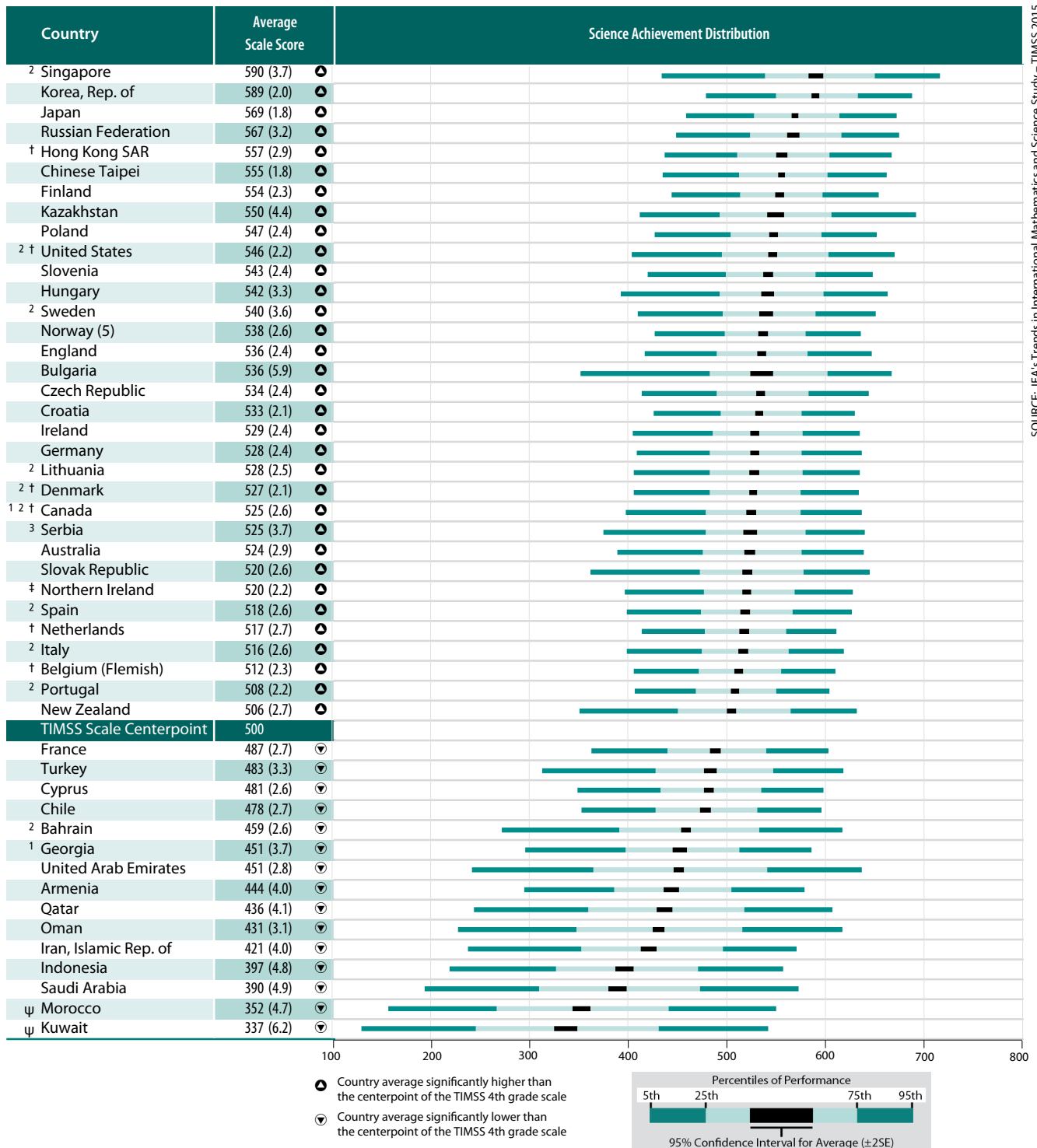
Exhibit 1.1: Distribution of Science Achievement